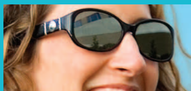
SILVER (Gray 3 polarized or solid tint)

is available in three color options on polarized or solid tinted lenses