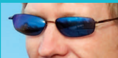
BLUE (Gray 3 polarized or solid tint)