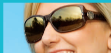
GOLD (Brown 3 polarized or solid tint)